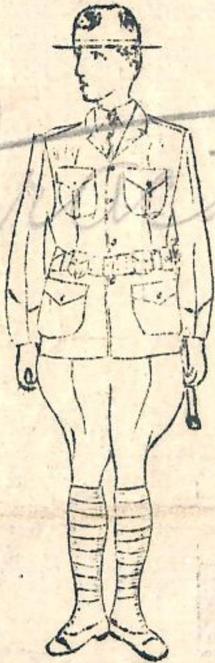
PLATE 6. Eyes Right Correct Position