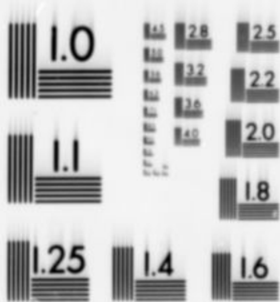
MICROCOPY RESOLUTION TEST CHART NATIONAL BUREAU OF STANDARDS STANDARD REFERENCE MATERIAL 1010a (ANSI and ISO TEST CHART No. 2)